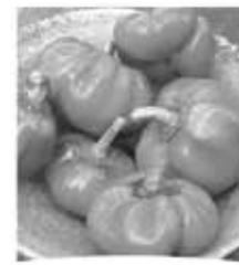
Tepepo Rosso Pepper