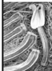
Dario F1 Zucchini