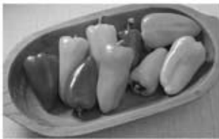
Sweet Specialty Peppers

Available at Johnnyseeds.com starting November 15, 2013