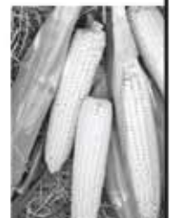
Bling F1 Sweet Corn

Just a few of over 650 varieties including high-yielding hybrid, unique heirloom and open-pollinated varieties.